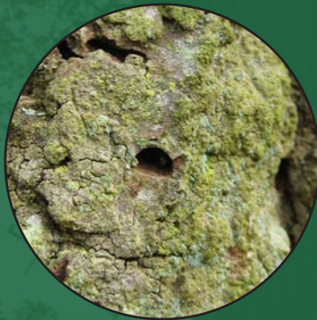
Agrilus beetle exit hole on bark